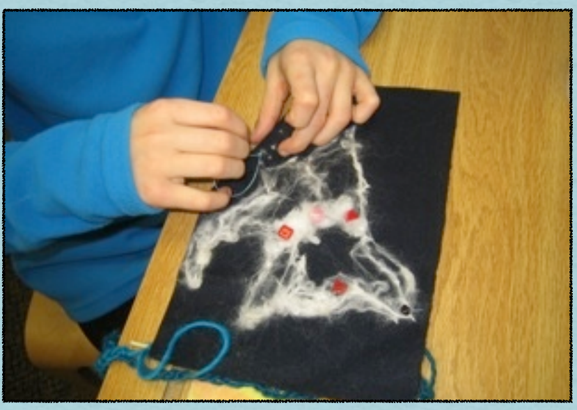
SILK COCOON DANCING FOX: VALERIE, GD 3