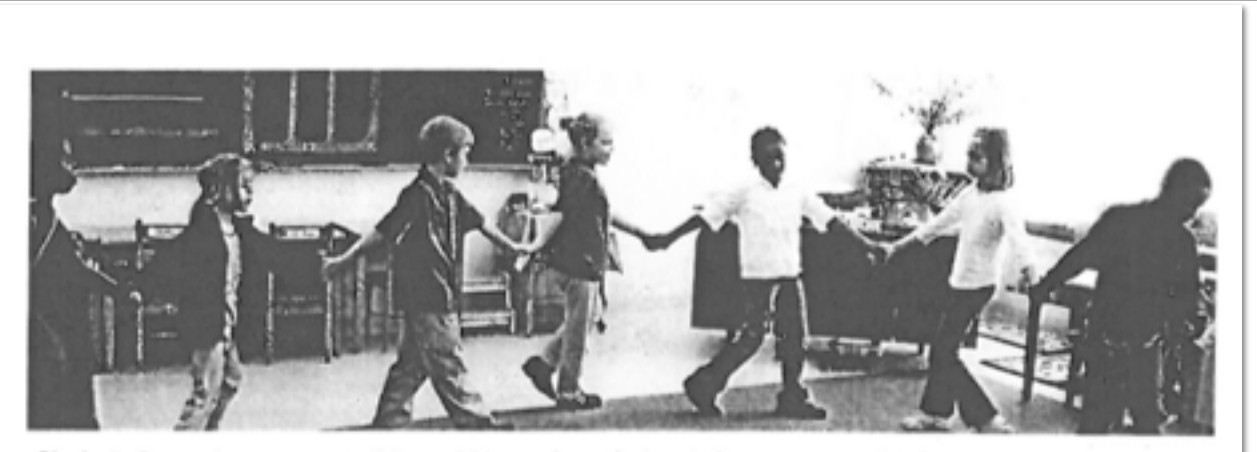
Rhythmic, harmonious, noncompetitive activities such as playing circle games, as in this first-grade class, help prepare young minds for writing and reading.

that the sound M is the first sound one hears when saying the word MOUNTAINS. Other examples include drawing a king out of the letter K, a bunny or a butterfly out of the letter B, and waves out of a W.