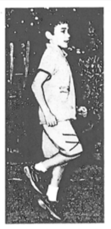
Cross-lateral movements such as skipping strengthen the bilateral integration of the brain and body, which promotes reading skills.

The sequence in which we teach children to write the different scripts is also important. Children should first learn to draw the capital letters as they are related to specific pictures. Next, the child can practice forms by repeating the small letters of the alphabet in cursive. Writing like this in cursive involves the right and left hemispheres working together. Printing the lowercase letters is a more